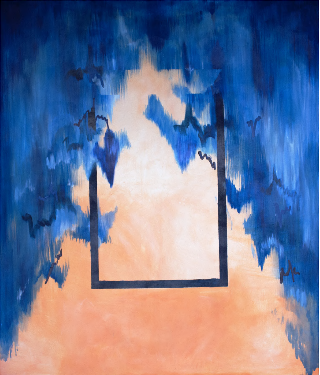
DAUDI KAGGWA Presence , 2023 Acrylic on stretched canvas 140 x 119.5 x 2.3 cm ZAR 33,000