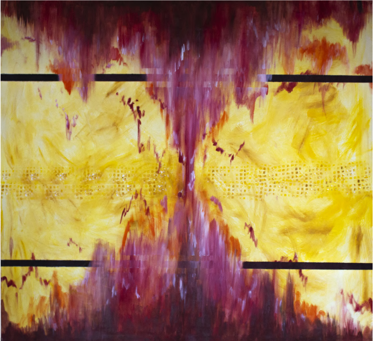
DAUDI KAGGWA The Mind an Inferno , 2023 Acrylic on stretched canvas 156 x 144 x 2.3 cm ZAR 40,000