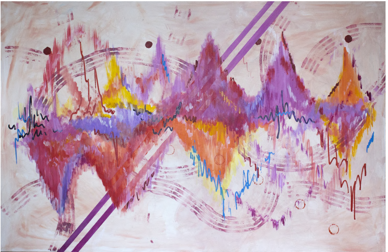
DAUDI KAGGWA Symphony Composition , 2023 Acrylic on stretched canvas 112.5 x 173.5 x 2.3 cm ZAR 36,000