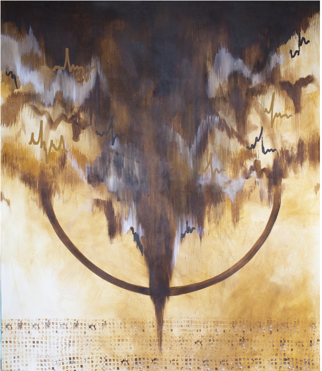
DAUDI KAGGWA Conscience , 2023 Acrylic on stretched canvas 140 x 119.5 x 2.3 cm ZAR 33,000