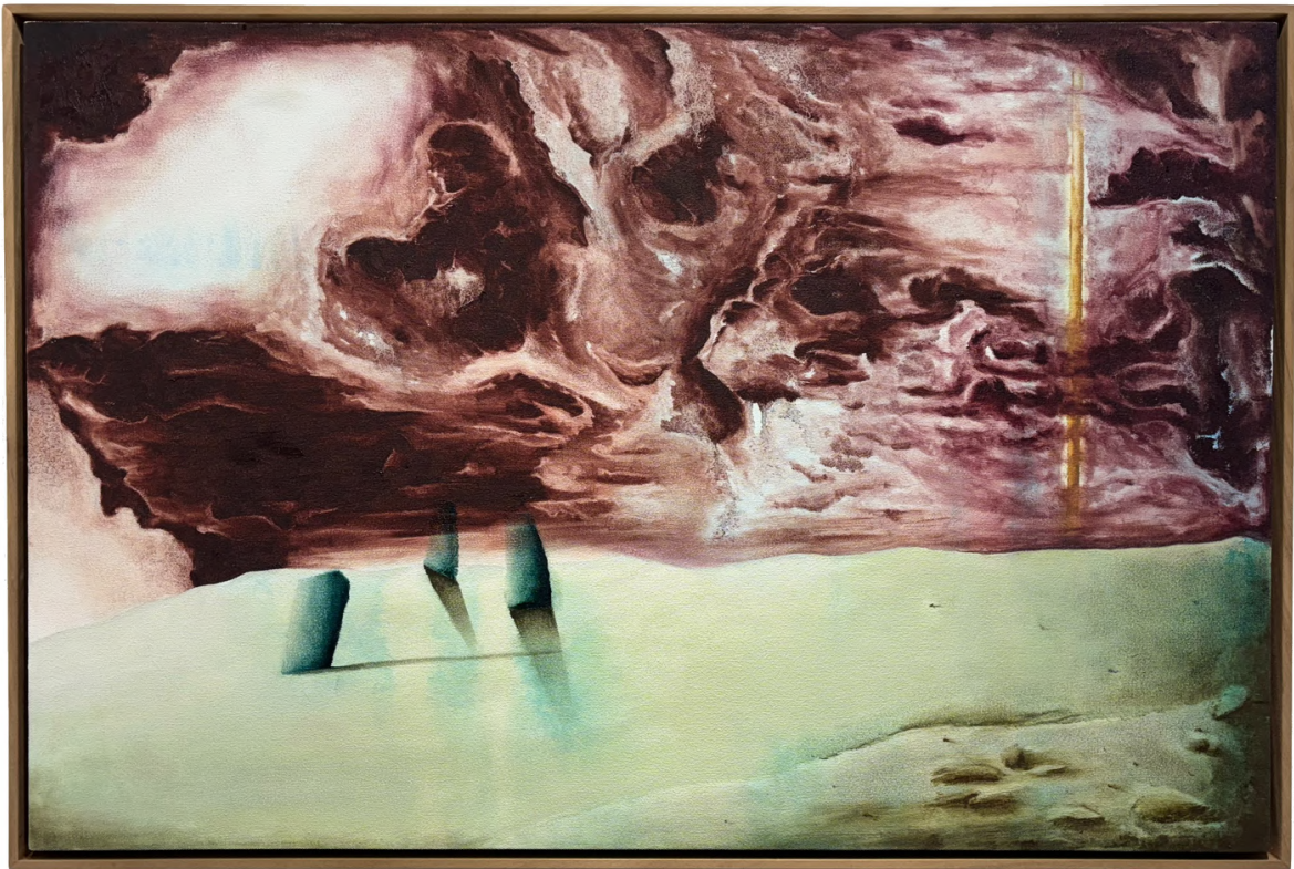
MHLONISHWA ZULU The fruits thereof , 2025 Oil and acrylic on canvas 60 x 90 cm / 62.5 x 93.5 x 5 cm framed ZAR 15,000