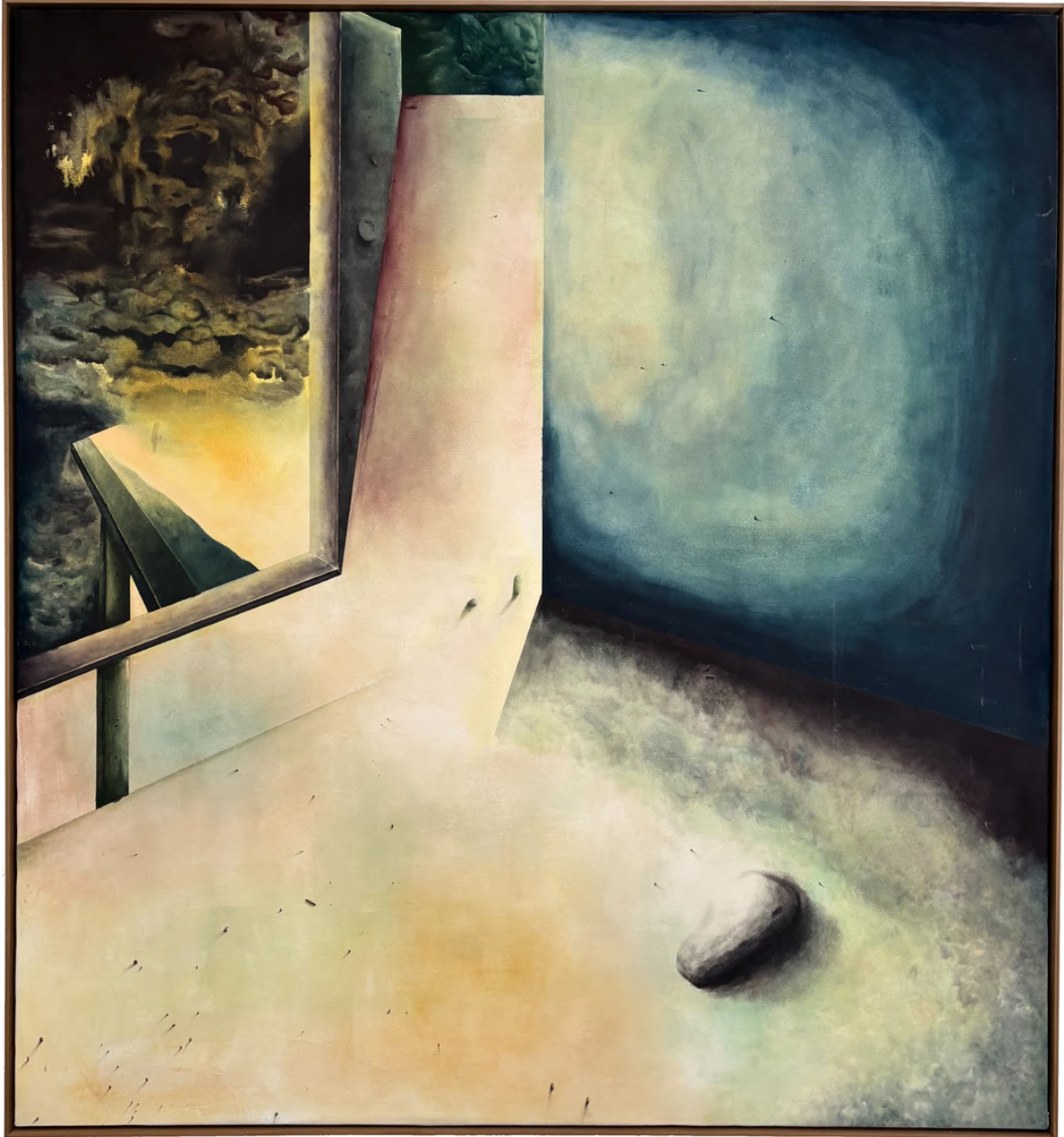
MHLONISHWA ZULU Shadow of the abstract , 2025 Oil and acrylic on canvas 184 x 171.5 cm / 187.5 x 174.5 x 5 cm framed ZAR 32,000