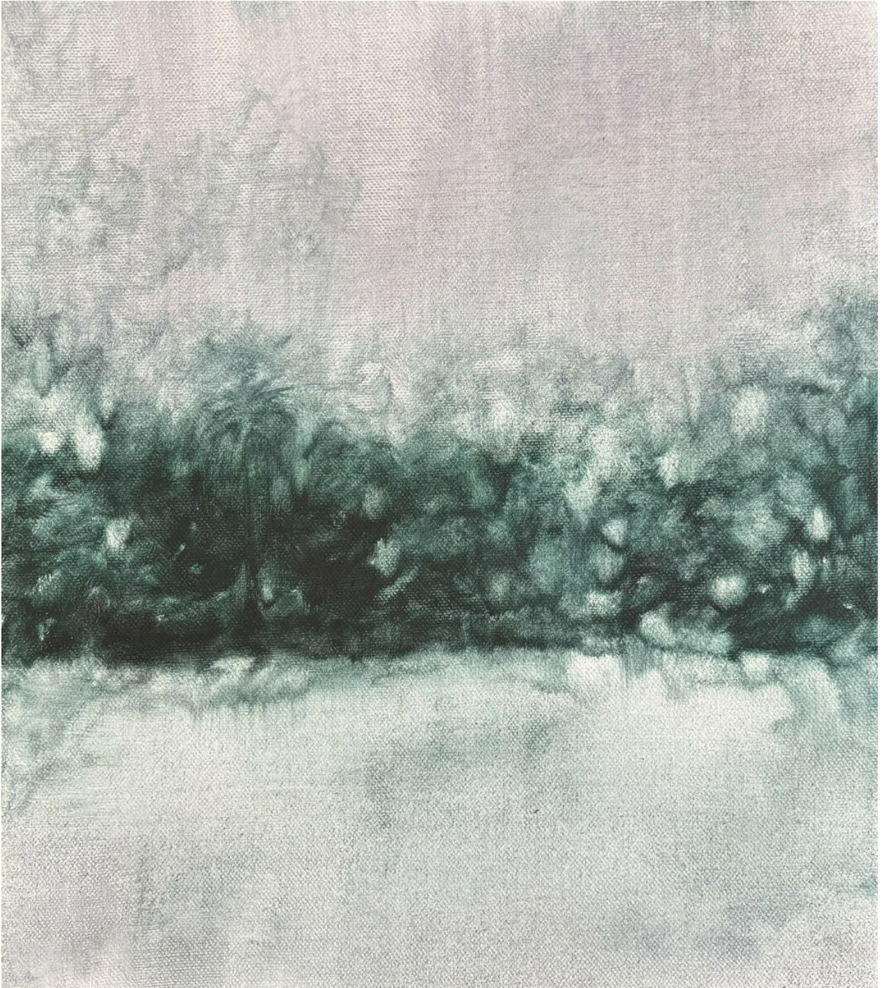
ZARAH CASSIM Jungle Jewel , 2020 Oil on canvas 30.5 x 27 x 3 cm ZAR 18,000