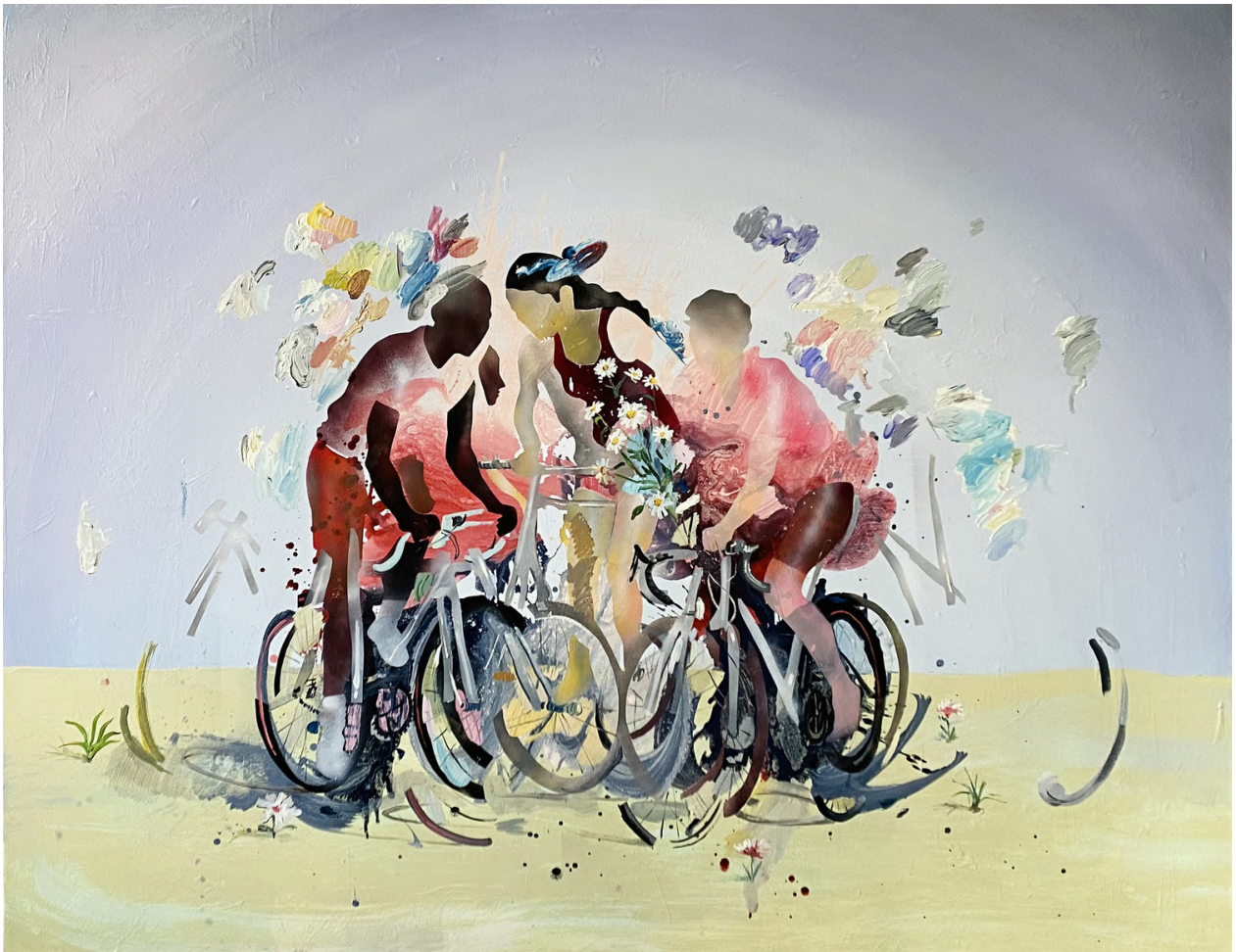
CHRIS DENOVAN Riders of the Low Plains , 2025 Oil, acrylic and spray paint on canvas 140 x 180 x 5 cm ZAR 80,000