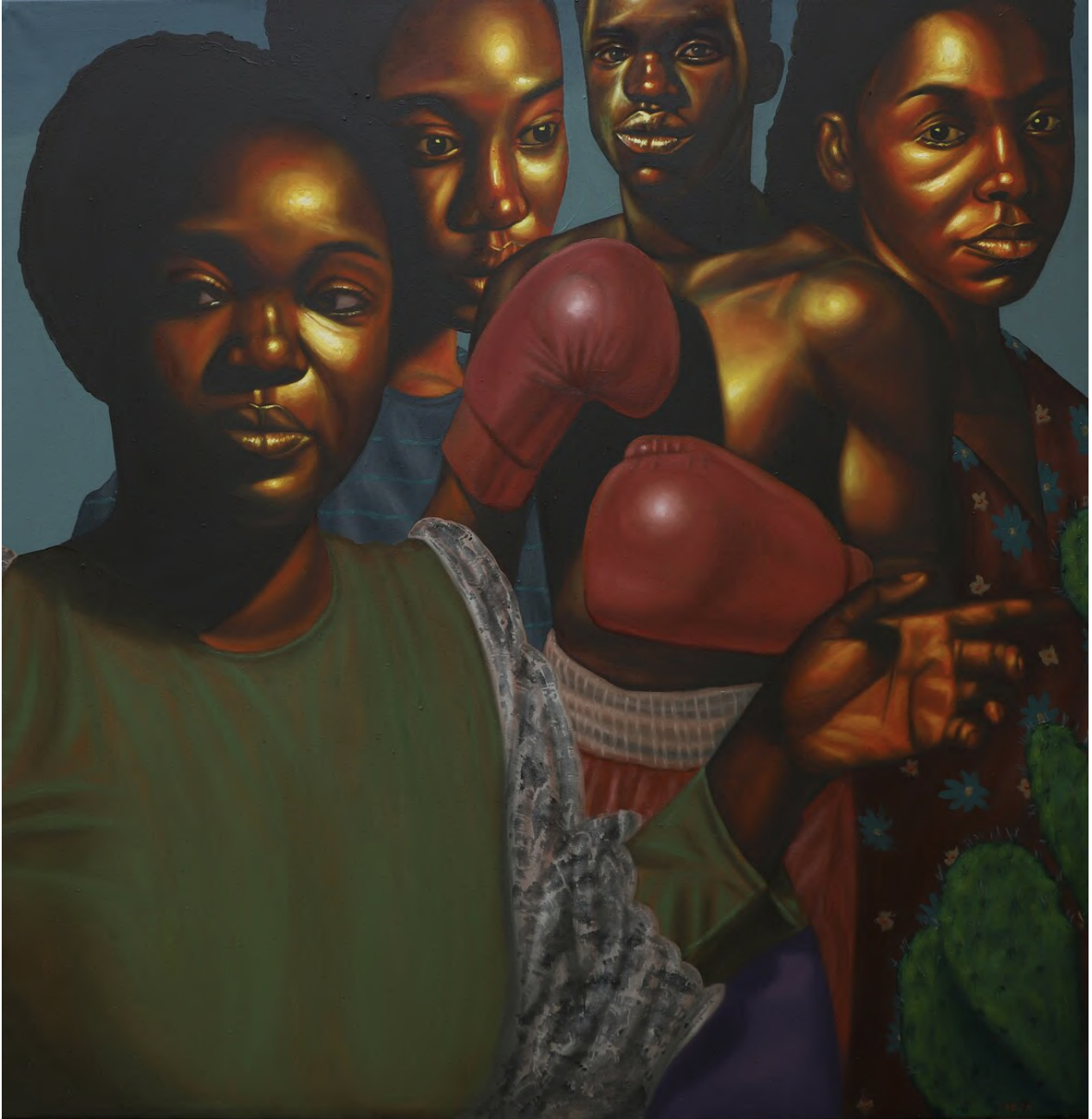
BARRY YUSUFU If the Cactus Pricks I , 2024 Oil on canvas 152.4 x 152.4 x 2.5 cm ZAR 330,000