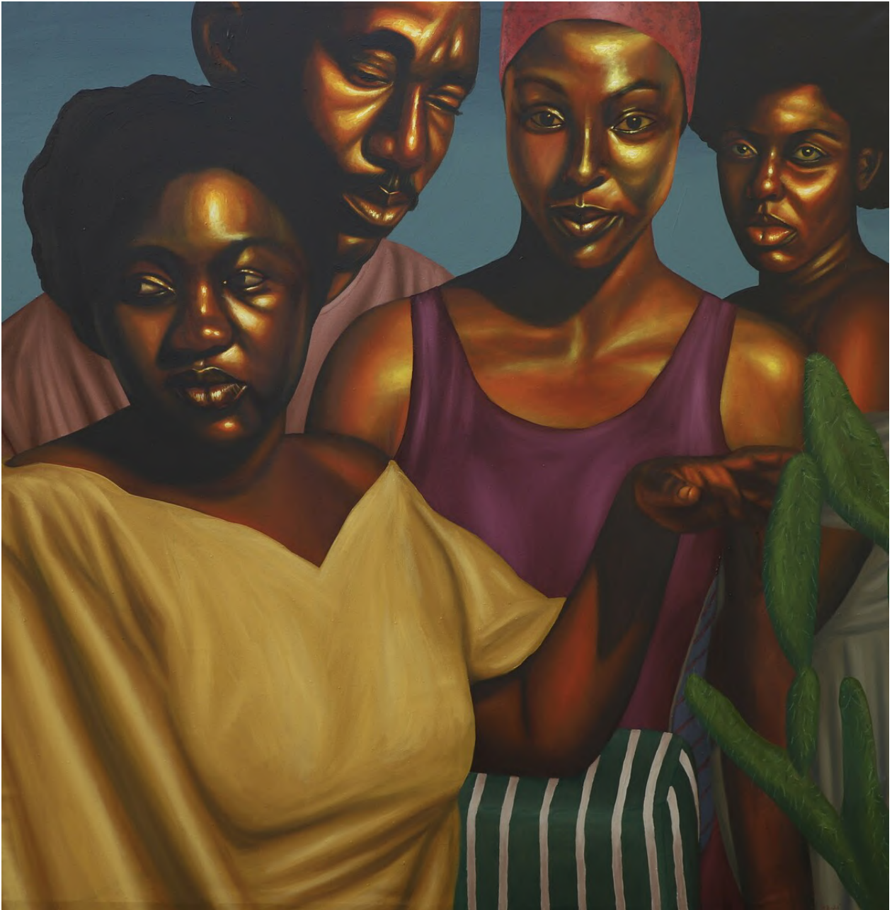
BARRY YUSUFU If the Cactus Pricks II , 2024 Oil on canvas 153 x 152.5 x 2.5 cm ZAR 330,000