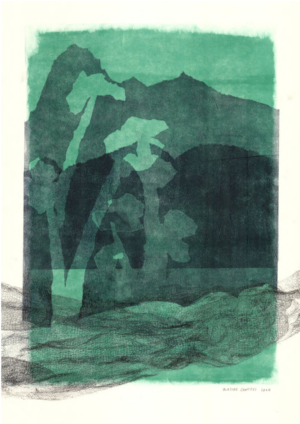
In the shadows I, 2024

Oil-based monotype with colour pencils on Fabriano Unica