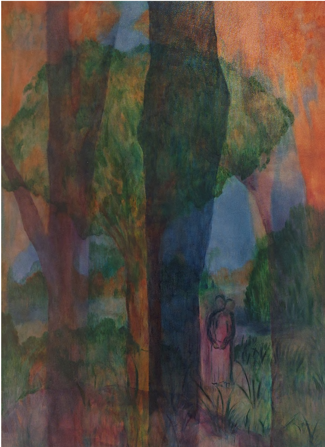
Solace , 2024 Oil on canvas 150 x 110 x 4.5 cm ZAR 39,000