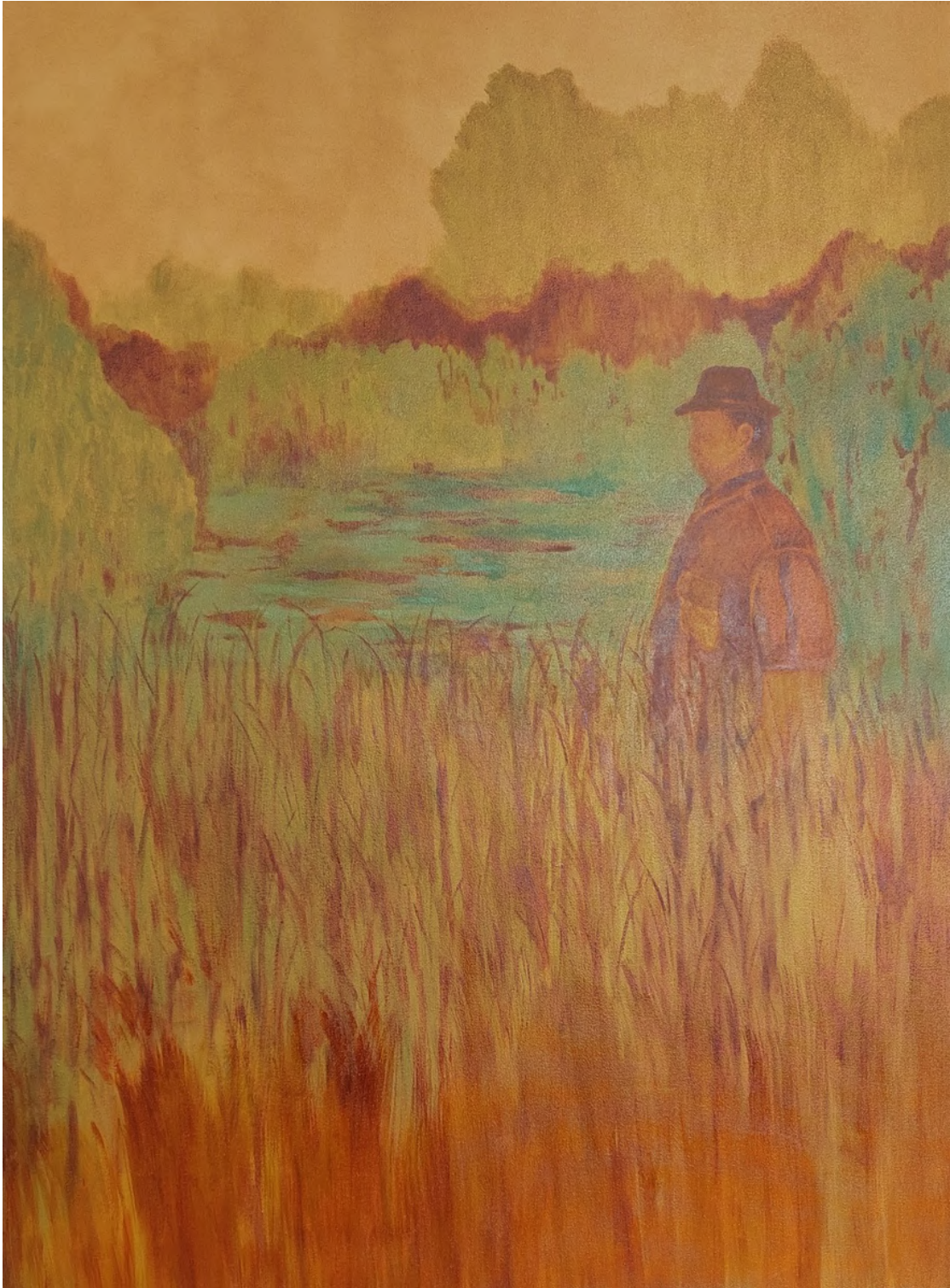
Forebear , 2024 Oil on canvas 150 x 110 x 4.5 cm ZAR 39,000