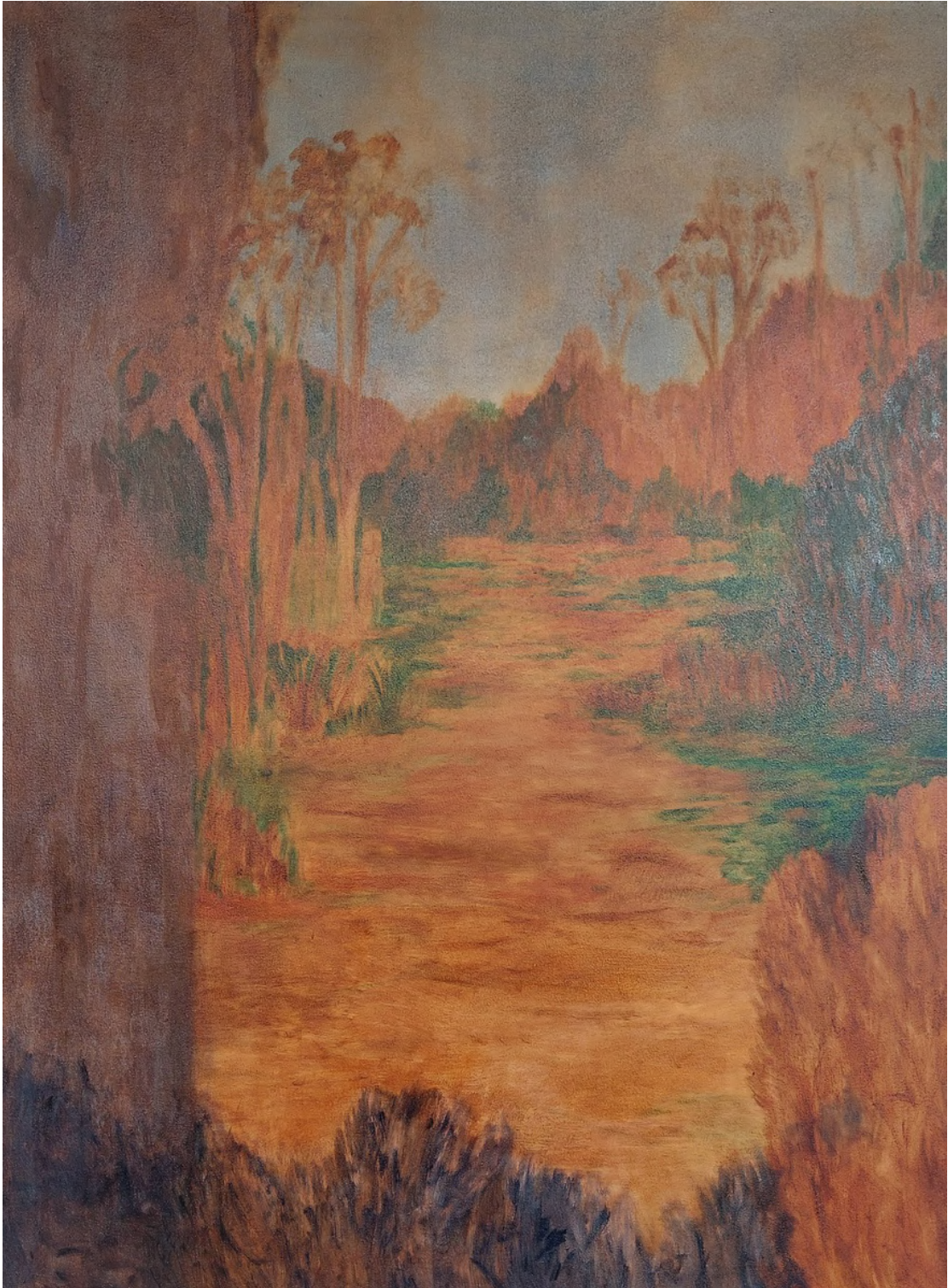
Mirage, 2024 Oil on canvas 150 x 110 x 4.5 cm ZAR 39,000