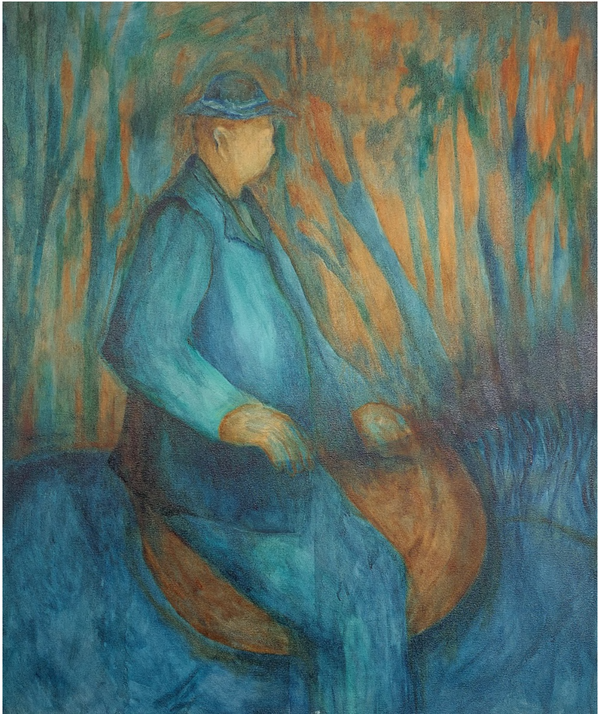
Watchman, 2024 Oil on canvas 91 x 76 cm Framed: 93.5 x 78.6 x 6.7 cm (Framed in kiaat) ZAR 23,000