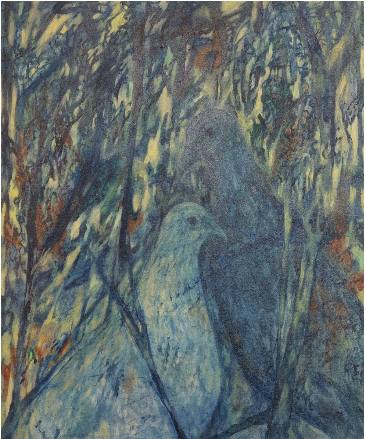
Onlookers , 2024 Oil on canvas 91 x 76 cm Framed: 93.5 x 78.6 x 6.7 cm (Framed in kjaat) ZAR 23,000