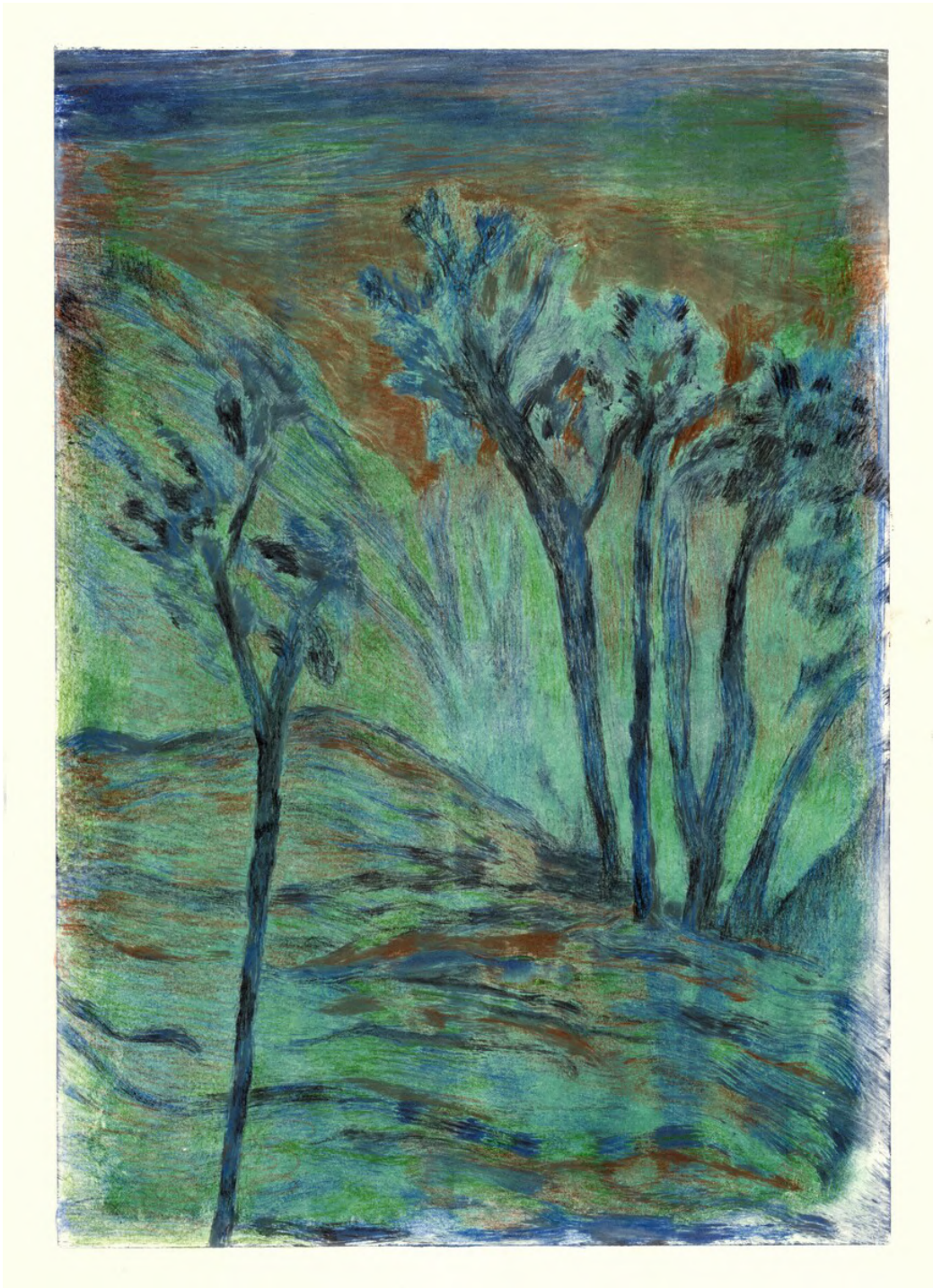
Wind in the trees I, 2024

Oil-based monotype with colour pencils on Fabriano Unica