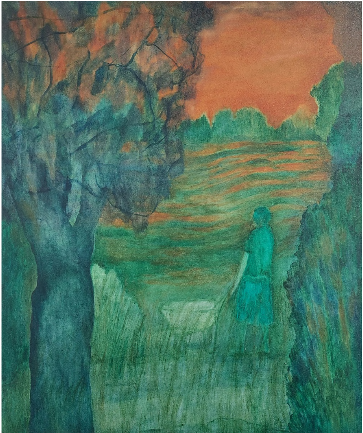
Omens , 2024 Oil on canvas 91 x 76 cm Framed: 93.5 x 78.6 x 6.7 cm (Framed in kiasat) ZAR 23,000