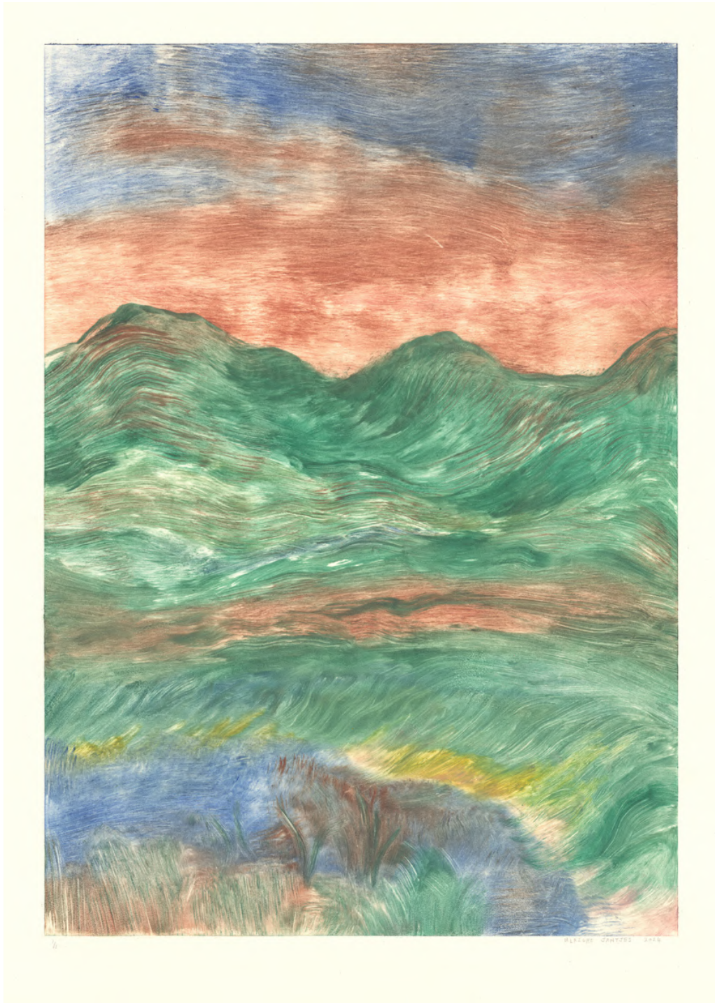
Expanse II, 2024 Oil-based monotype on Fabriano Rosapina 65.5 x 47 cm Framed: 71.8 x 52.9 x 3.5 cm (Framed in kjaat) ZAR 14,000