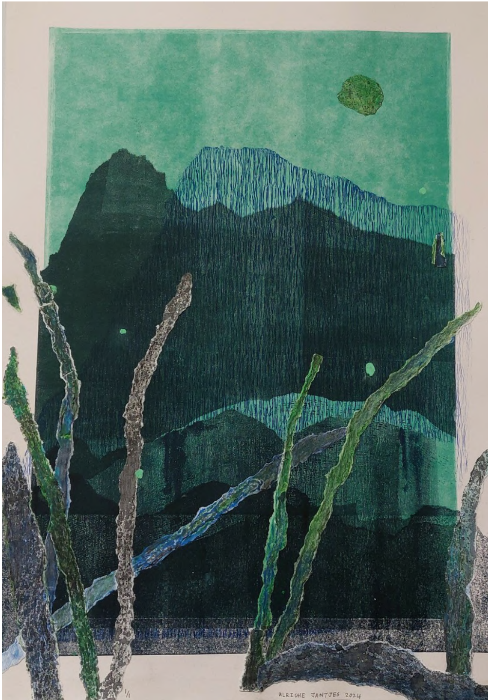
In the shadows II, 2024 Mixed media oil-based monotype on Fabriano Unica 49.5 x 34.5 cm Framed: 55.6 x 40.5 x 3.5 cm (Framed in kjaat) ZAR 12,000