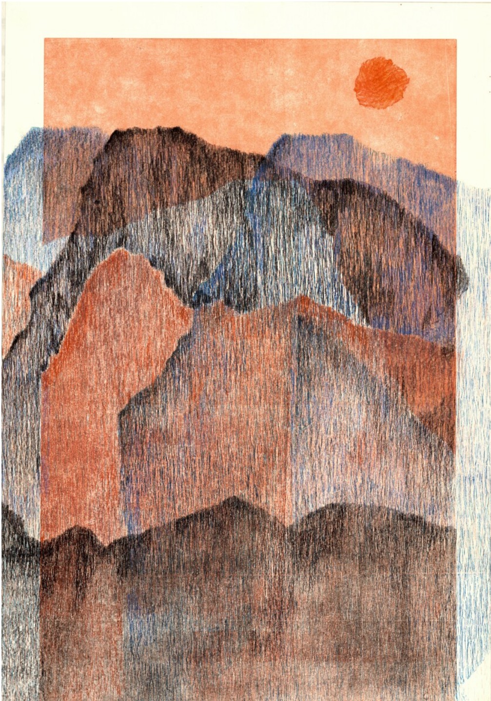
Tangerine sky I, 2024

Oil-based monotype with colour pencils on Fabriano Unica