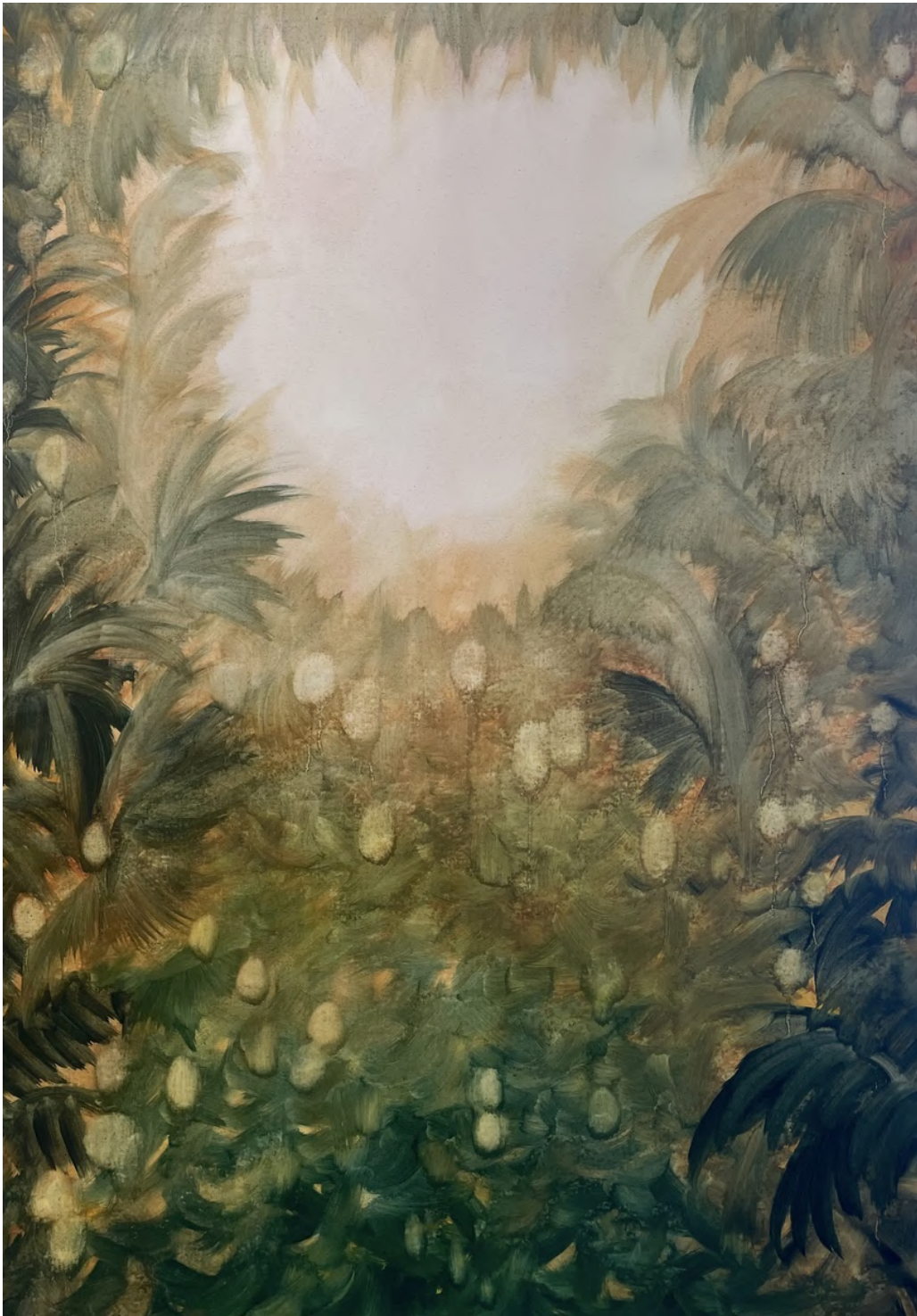
ZARAH CASSIM Landing , 2024 Oil on canvas 119 x 84 x 1.5 cm ZAR 55,000