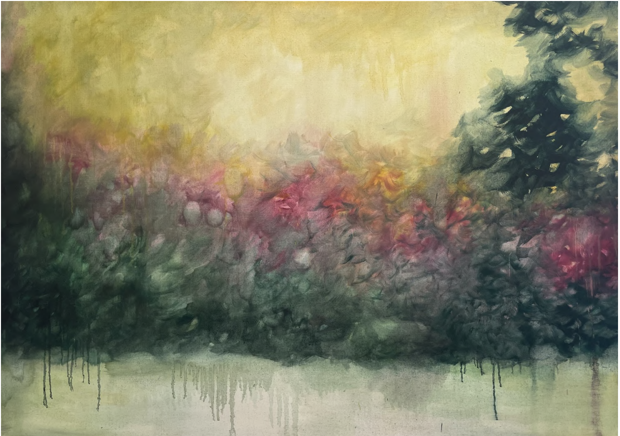
ZARAH CASSIM I Move , 2024 Oil on canvas 84 x 118.5 x 1.5 cm ZAR 55,000