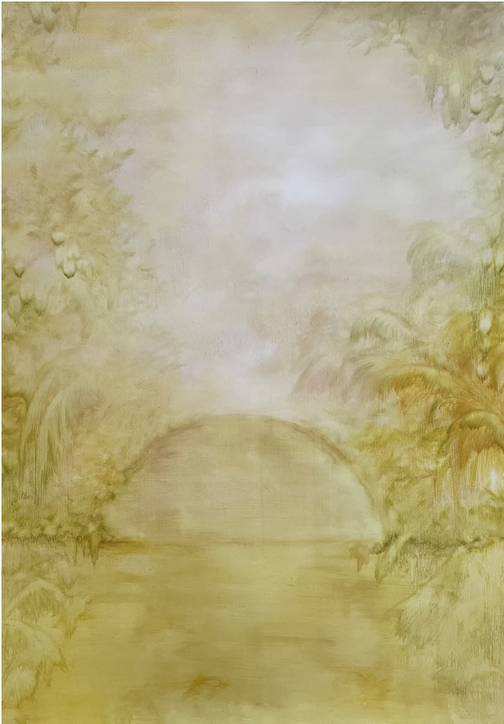
ZARAH CASSIM Sun Shine , 2024 Oil on Fabriano Framed: 106.5 x 79.5 x 3.5 cm ZAR 30,000