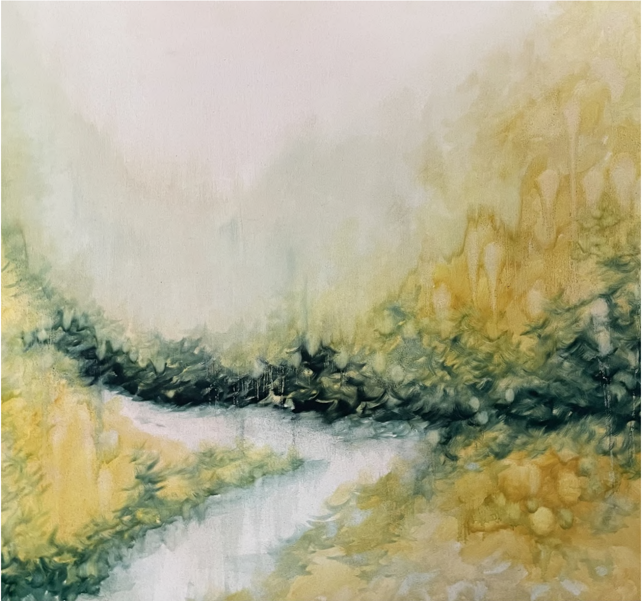
ZARAH CASSIM Down the Lane , 2024 Oil on canvas 88 x 93.5 x 3 cm ZAR 50,000