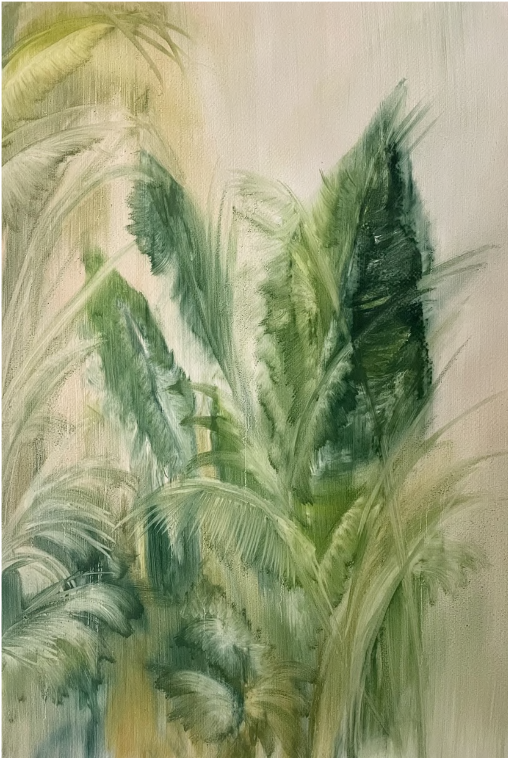
ZARAH CASSIM Foliage , 2024 Oil on Fabriano Framed: 64 x 46 x 3.5 cm ZAR 17,000