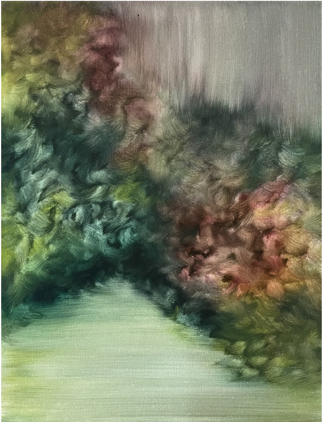
ZARAH CASSIM Stone I , 2024 Oil on canvas 36 x 28 x 2 cm ZAR 17,000