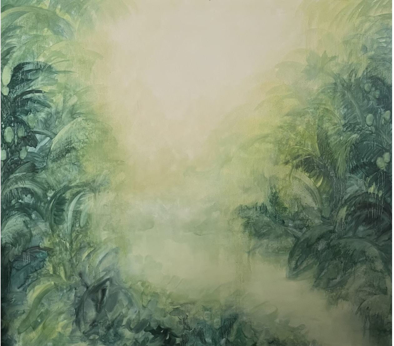
ZARAH CASSIM Younger Love , 2024 Oil on canvas 179.8 x 160.5 x 4 cm ZAR 100,000