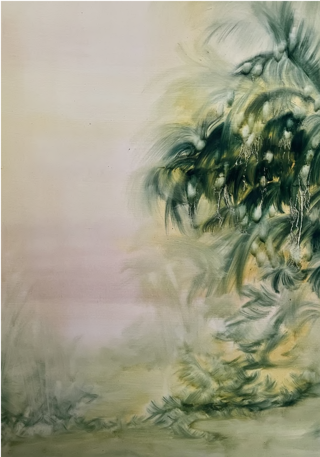
ZARAH CASSIM Folly , 2024 Oil on Fabriano Framed: 63.8 x 46.5 x 3.5 cm ZAR 17,000