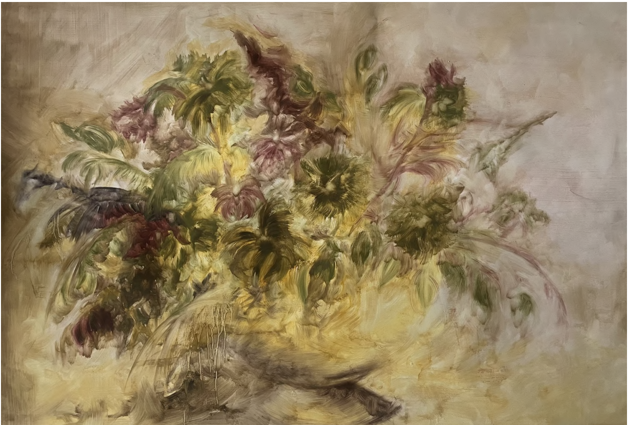
ZARAH CASSIM Time , 2024 Oil on Fabriano Framed: 76 x 106.2 x 3.5 cm ZAR 35,000