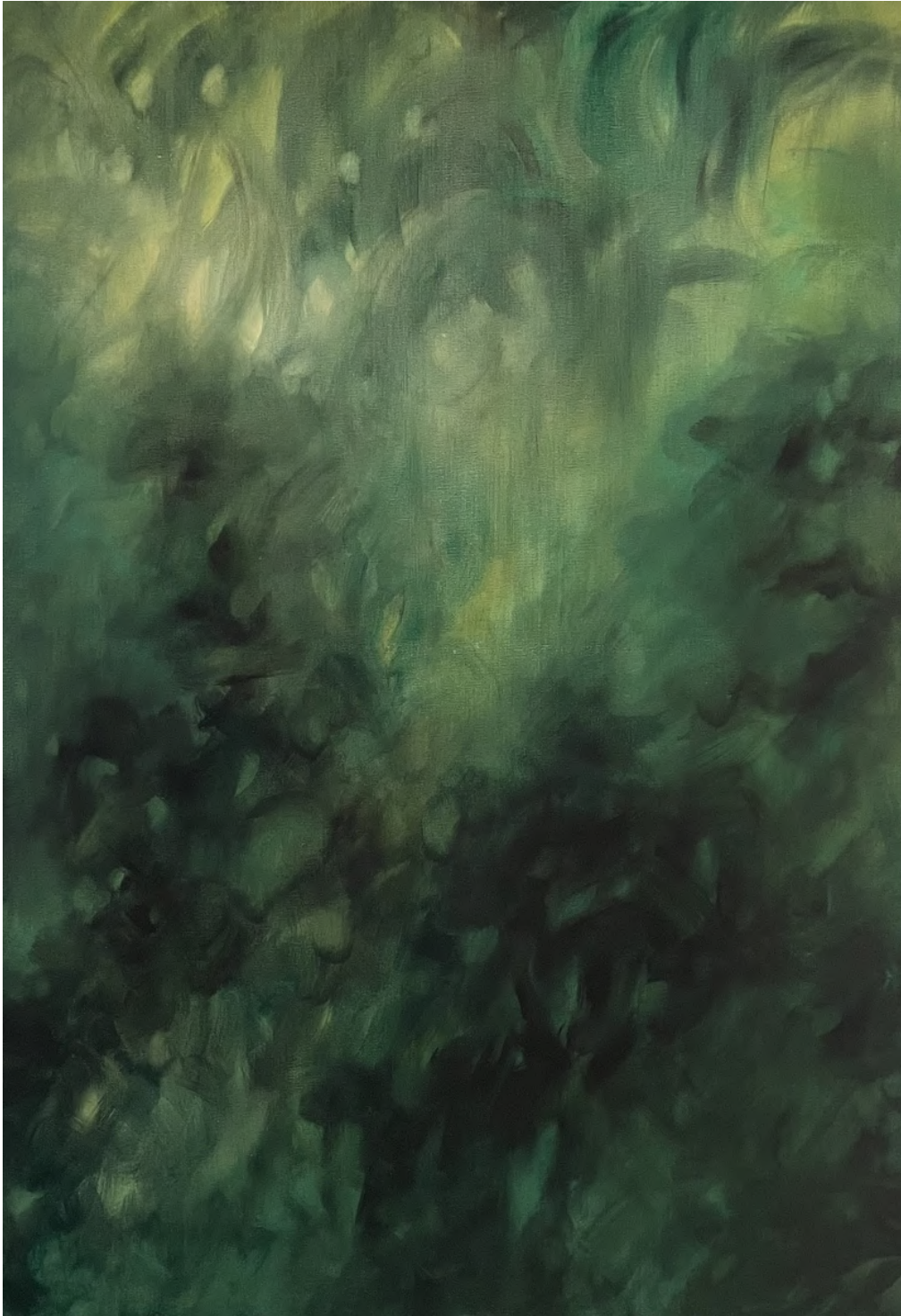
ZARAH CASSIM Emeralds , 2024 Oil on canvas 84 x 59.5 x 1.5 cm ZAR 42,000