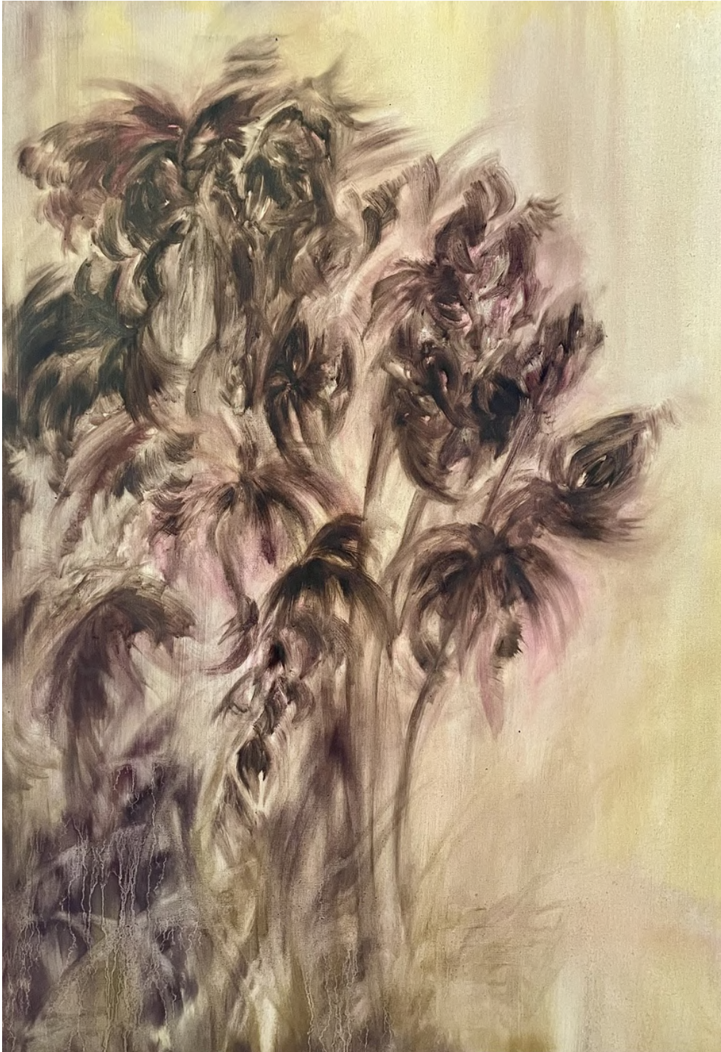
ZARAH CASSIM The Fall , 2024 Oil on canvas 84 x 59.5 x 1.5 cm ZAR 42,000