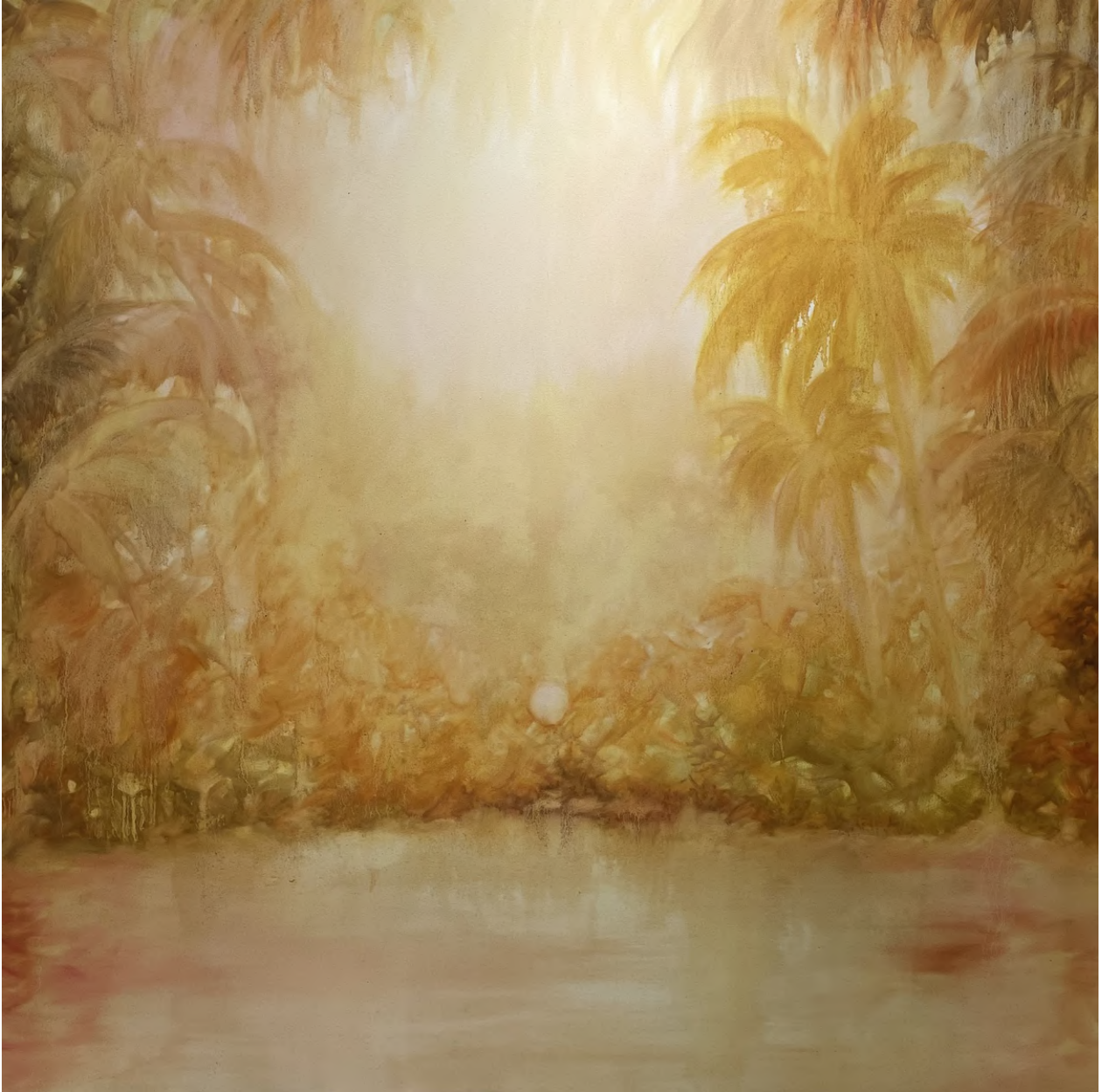
ZARAH CASSIM Feels like Fever , 2024 Oil on canvas 150 x 150 x 4 cm ZAR 90,000