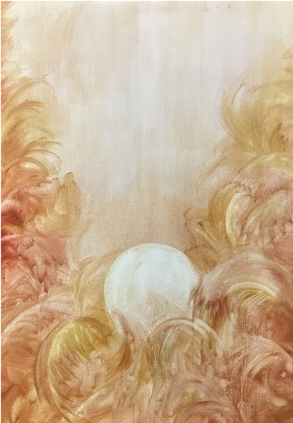
ZARAH CASSIM Pêche , 2024 Oil on canvas 84.5 x 59.3 x 1.5 cm ZAR 42,000