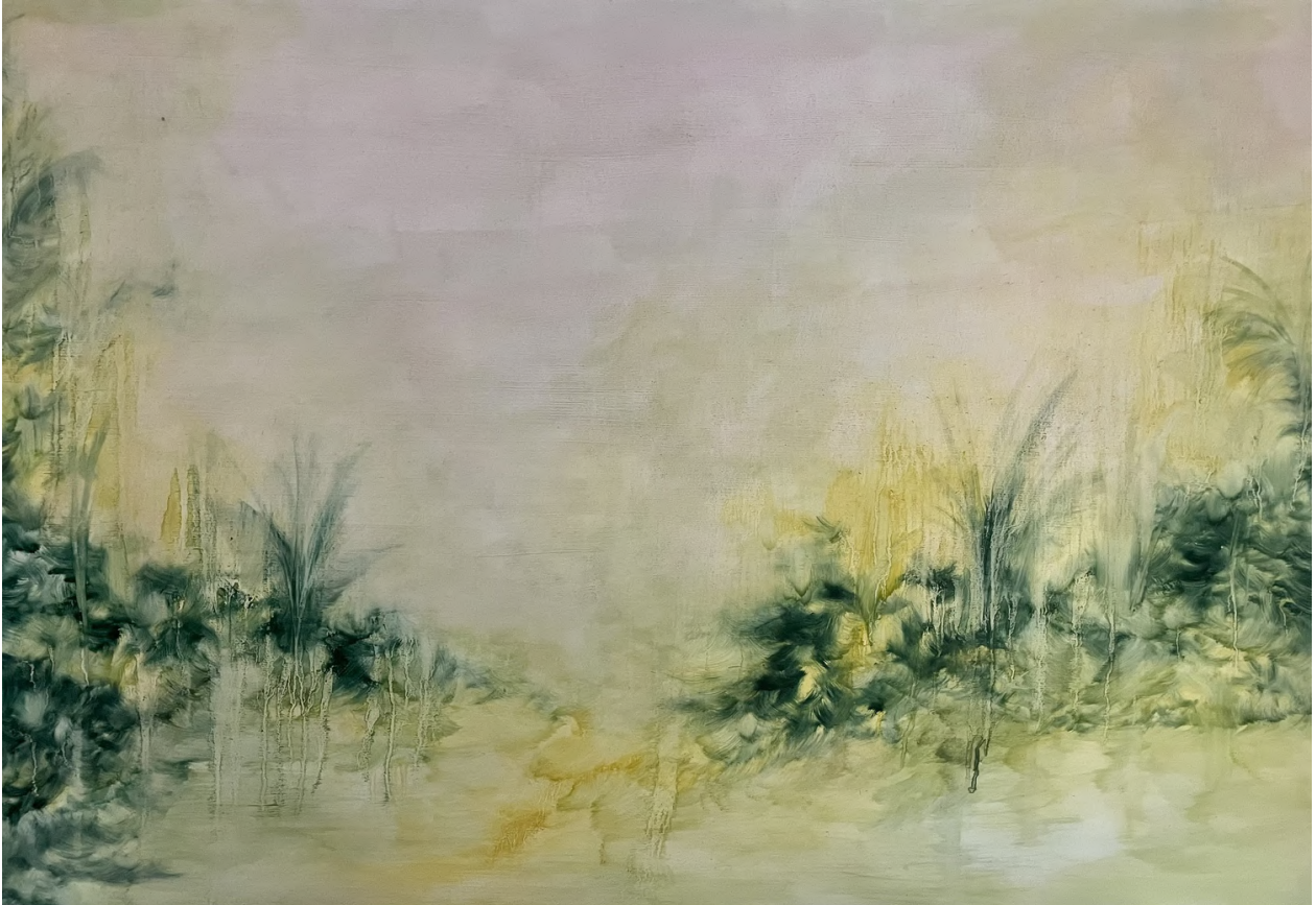
ZARAH CASSIM No Sound , 2024 Oil on Fabriano Framed: 76 x 106.4 x 3.5 cm ZAR 35,000