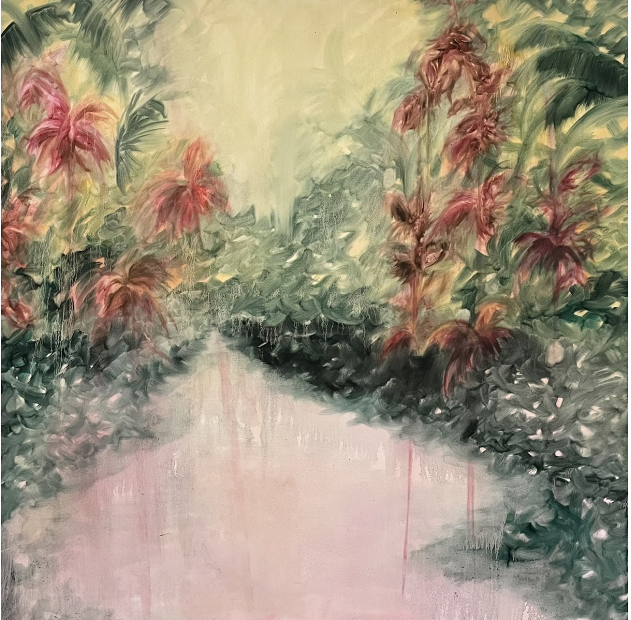
ZARAH CASSIM Weave Together , 2024 Oil on canvas 150 x 150 x 4 cm ZAR 90,000