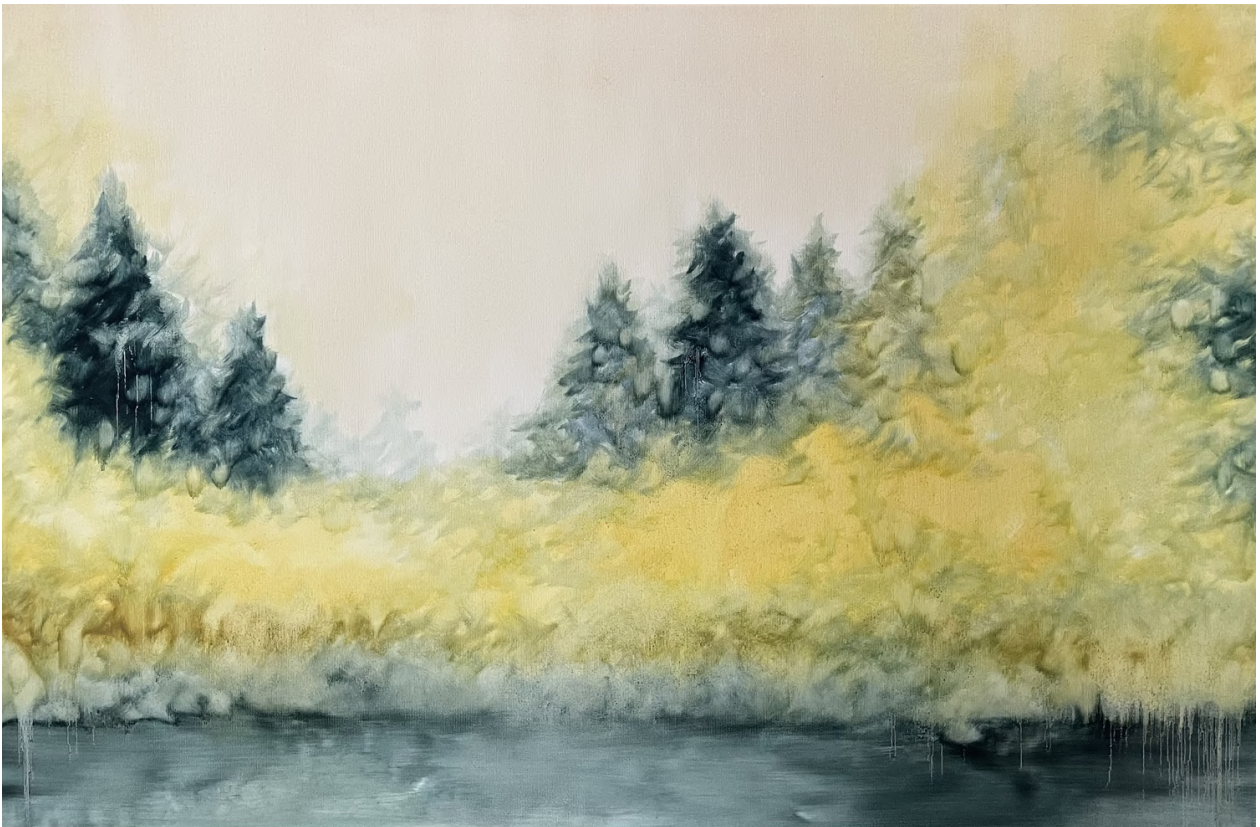
ZARAH CASSIM Words , 2024 Oil on canvas 61 x 92 x 3 cm ZAR 42,000