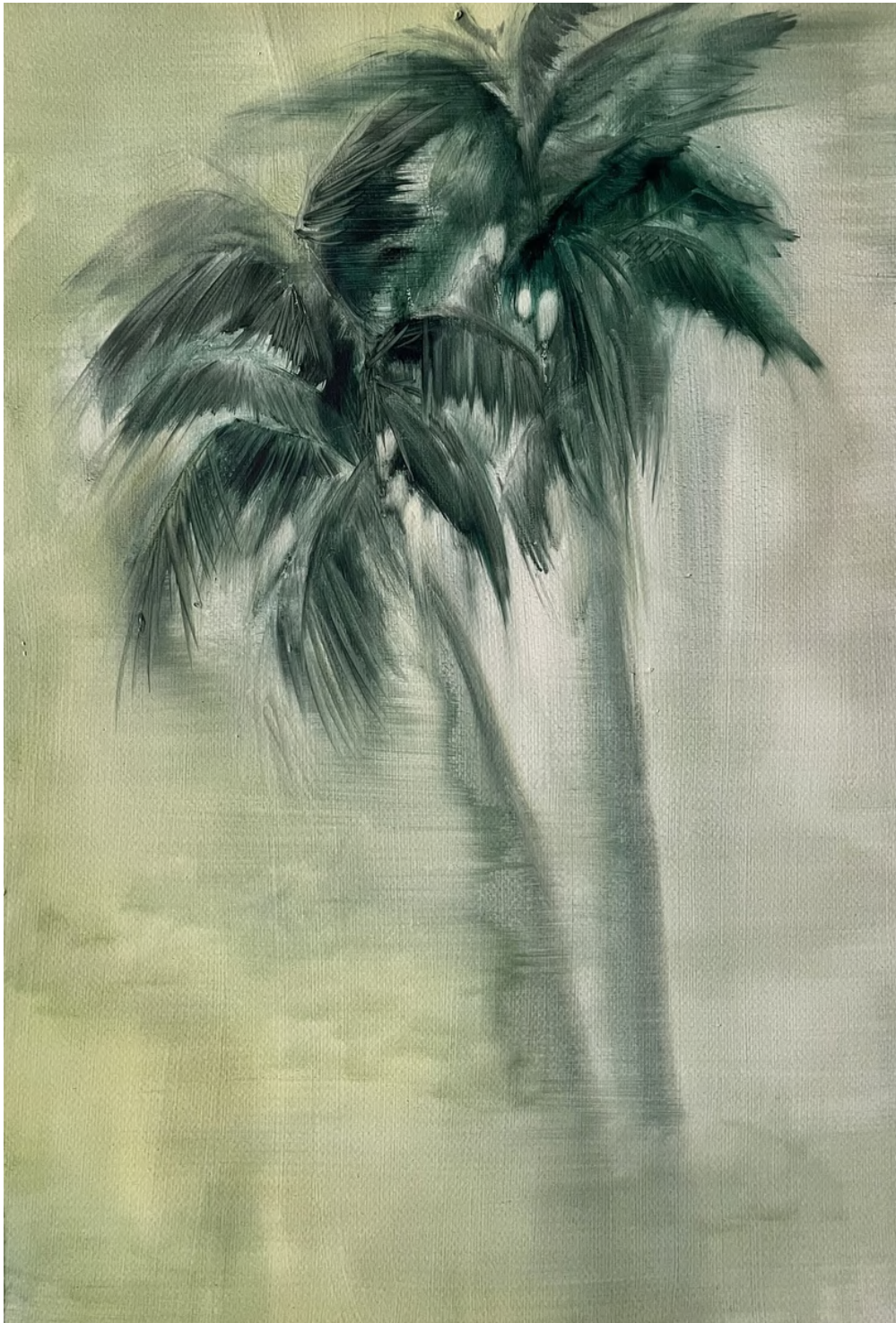
ZARAH CASSIM Winds , 2024 Oil on Fabriano Framed: 63.8 x 46.2 x 3.5 cm ZAR 17,000