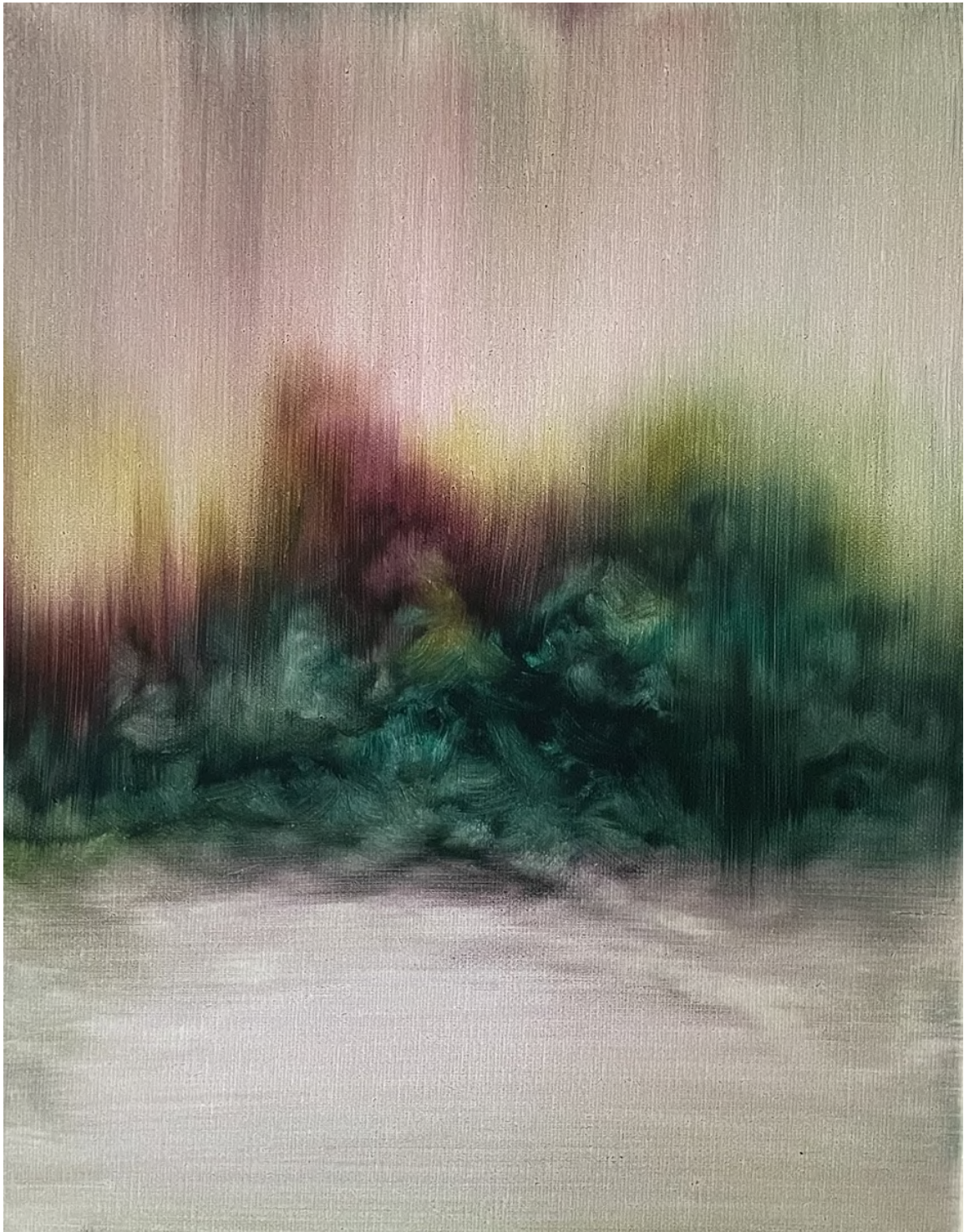
ZARAH CASSIM Stone II , 2024 Oil on canvas 36 x 28 x 2 cm ZAR 17,000