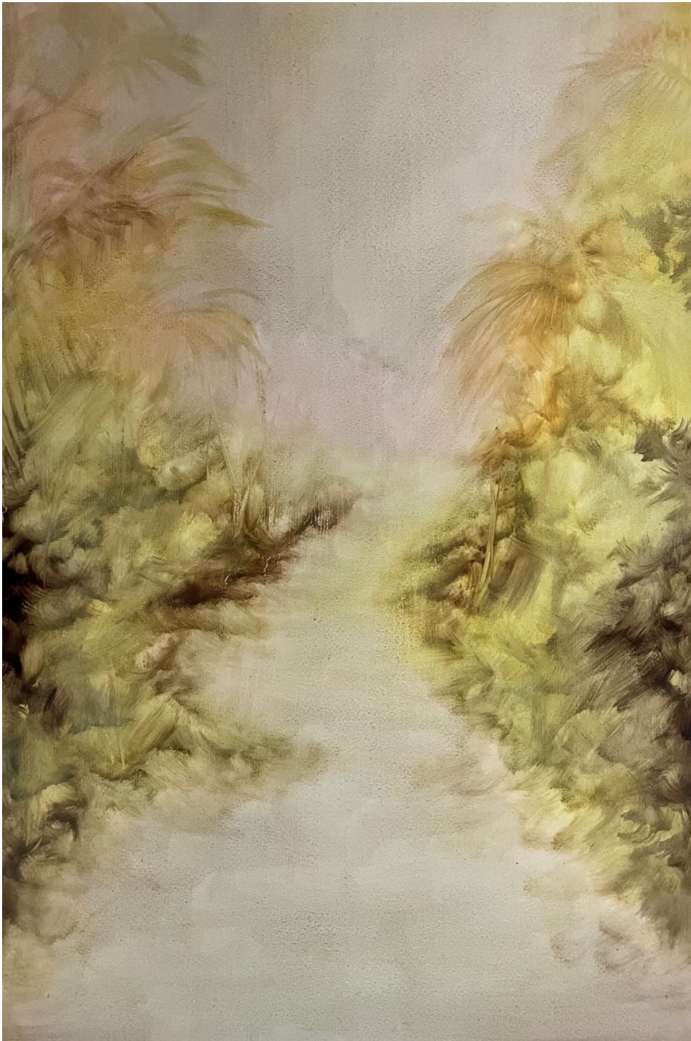
ZARAH CASSIM Path , 2024 Oil on Fabriano Framed: 63.4 x 45.8 x 3.5 cm ZAR 17,000