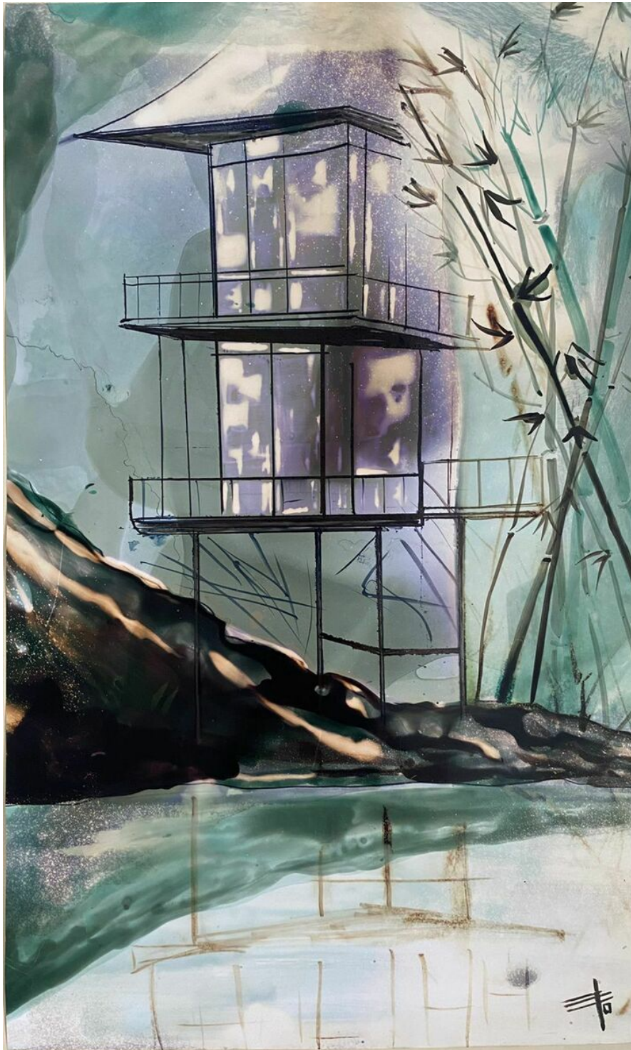
ELODIE BURLS Contemplate , 2024 Ink on waterproof paper 46 x 28 cm / 55.5 x 37 x 3.5 cm framed ZAR 8,000